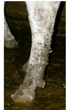
SCORE 4 Very dirty, where there are confluent plaques of caked-on manure on the foot and higher up the lower limb