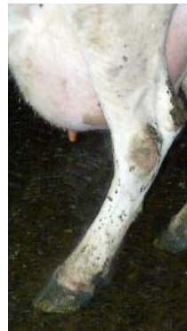
SCORE 2 Slightly dirty, where the lower limb is lightly splashed with manure