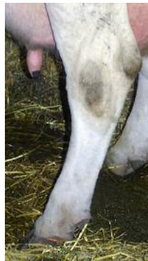
SCORE 1 Clean, little or no manure contamination of the lower limb

Score at least 20% of the cows in each pen in a free stall herd or all of the cows in a tie stall herd