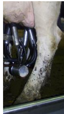
SCORE 3 Moderately dirty, where there are distinct plaques of manure on the foot, progressing up the limb