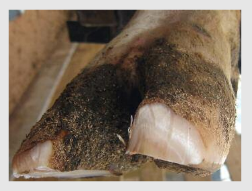
Note the horn removed in the toe and the location of the white line. The overgrown sole has not been removed.

TEST: The trimmer must be observed to detect this problem. They will typically use a grinder to thin the dorsal hoof wall down and avoid trimming the sole, but this technique must be differentiated from the trimming of corkscrew claws, where the dorsal wall curvature is corrected before the sole is trimmed.