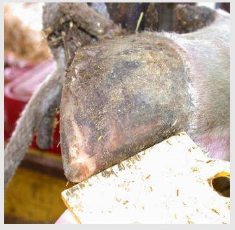
Note the length of the toe relative to a 3 inch marker. This claw is clearly too short.

TEST: Measure the dorsal claw wall using a 3 inch marker from the hard horn approximately midway down the periople to the toe. Identify claws that are too short.