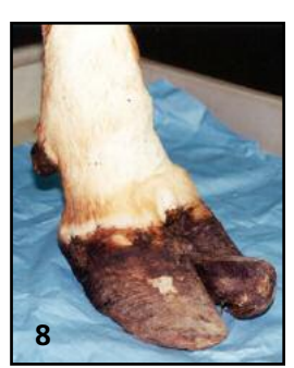
Figures 6-8. Abnormal curvature of the outer wall.

claw particularly at the heel and axial heel sole junction (Figure 4 & 6). In some instances the opposite claw may become virtually non-weight bearing and appears to undergo dis-