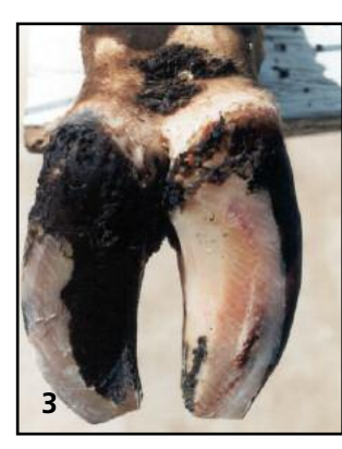
Figures 1-3. Abaxial curvature of P3 and white line lesions.