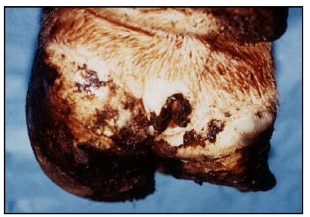
Figure 4. Increased loading of the corkscrew claw.