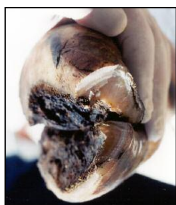
Figure 5. Overgrowth of sole and wall at the toe.